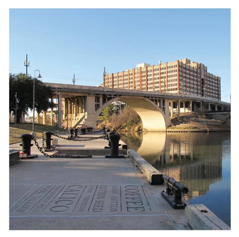
UH Main Street Bridge Facing South, 1952