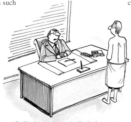
Call this a hunch Bob, but are you having debt problems?

The information contained herein is general in nature and is not intended as legal, tax, or investment advice, and should not be used in any actual transaction without the advice and guidance of a professional tax advisor who is familiar with all the relevant facts. HMEPS assumes no obligation to inform any person of any changes in the tax law or other factors that could affect the information contained herein.