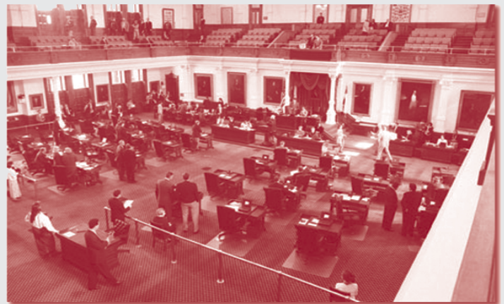
Texas Senate Chambers, Austin, Texas.